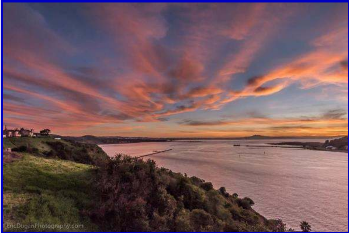
San Pablo Bay @ Napa River.

Want to stay connected with what's happening in Vallejo? Sign up for the City of Vallejo's E-Newsletter and other communication options at http://www.ci.vallejo.ca.us/cms/one.aspx?objectId=26266