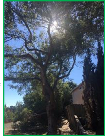
Tree at Pueblo Way