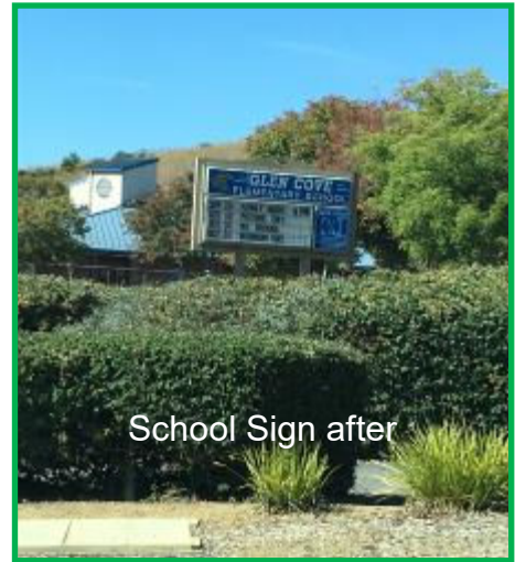
School Sign after