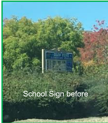
School Sign before