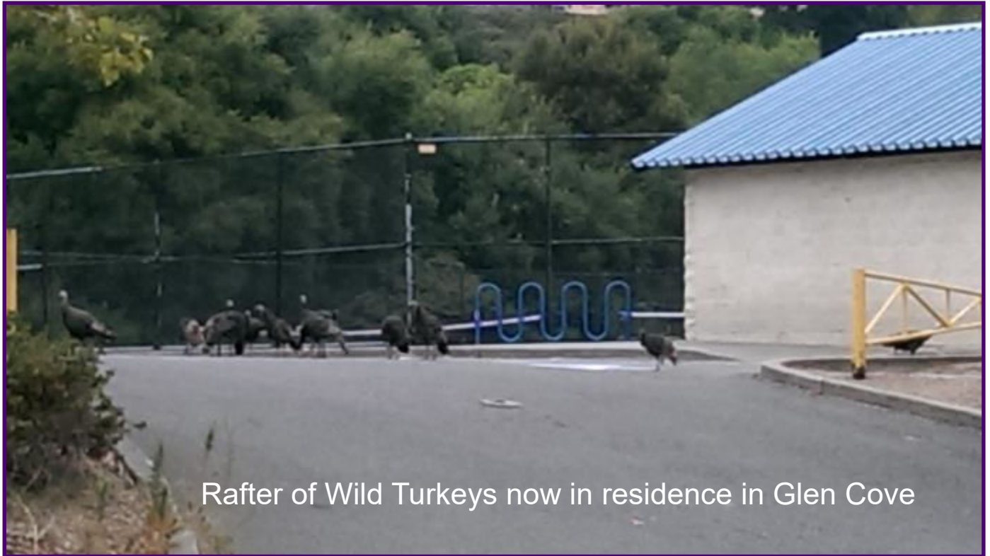
Rafter of Wild Turkeys now in residence in Glen Cove

Want to stay connected with what's happening in Vallejo? Sign up for the City of Vallejo's E-Newsletter and other communication options at http://www.ci.vallejo.ca.us/cms/one.aspx?objectId=26266